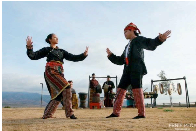
PAKARGUAN KULINTANG ENSEMBLE Filipino Music and Dance